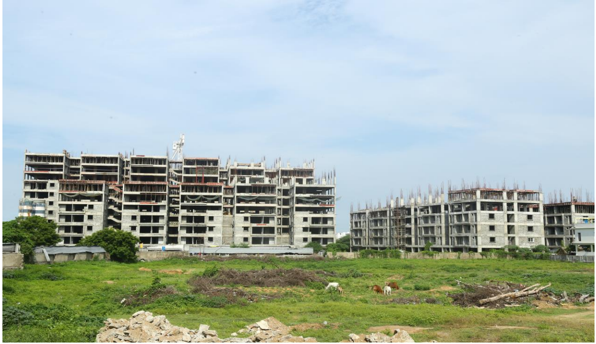
View of D1 Block & D2 Block