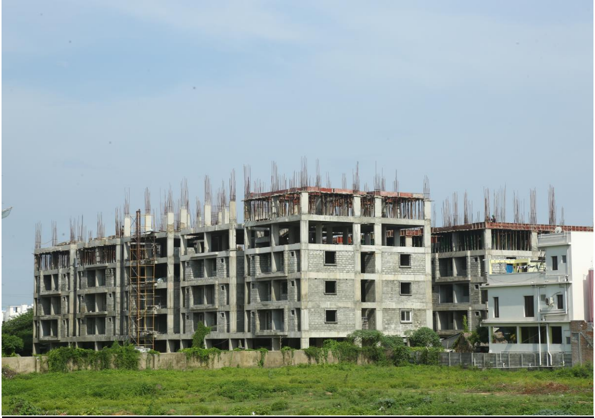
View of C2 & C3 Block